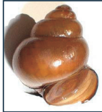
Chinese mystery snail