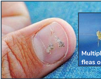
Multiple spiny water fleas on a fishing line