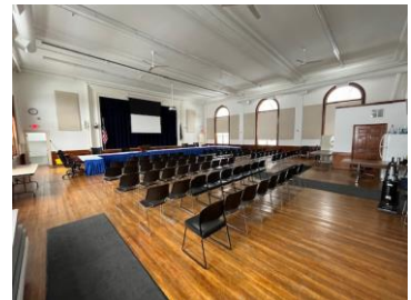
Illustration 1 Main Room Town Hall