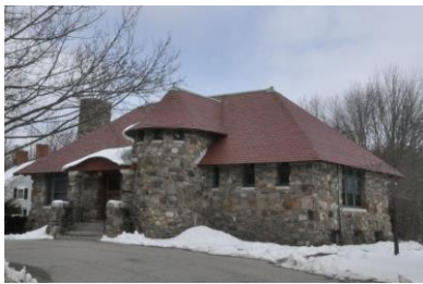
Illustration 4 Nichols Historical Museum