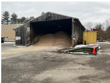
Illustration 2 Salt Shed