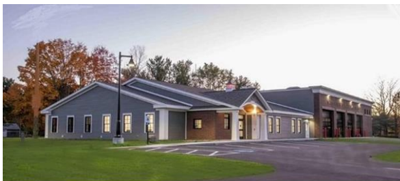
Illustration 3 Kingston Fire Department

The fourth project listed on the CIP is the bond payments for the new central fire station. These payments include both principal and interest for the 20-year bond.