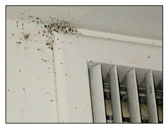
Bed bug fecal stains near a duct indicate harborage and possible movement.