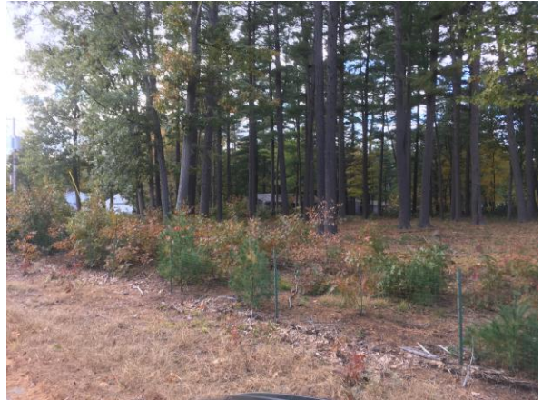
Illustration 2 - Location of proposed grassy field

The Kingston Recreation Commission submitted one project for the CIP cycle. This project is the installation of a new floor at the recreation center. The cost for this project is $18,338 and the project is scheduled for 2020.