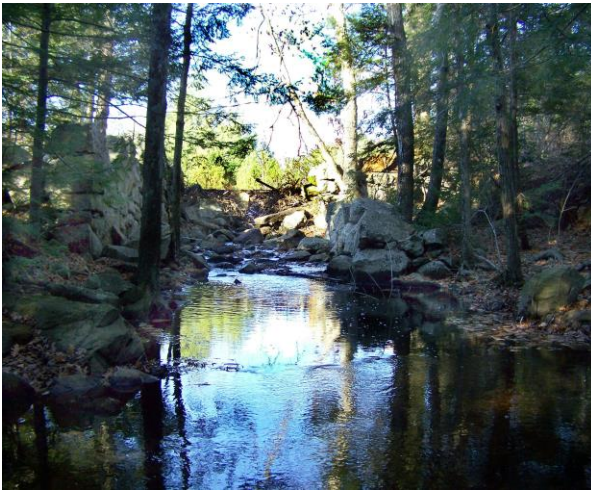
Illustration 3 - Natural resource protection

is difficult to project exactly when the goal will be met. For purposes of CIP planning it is estimated that this undertaking will be completed in the next ten years. Due to the inability to forecast when a property will be available for protection the program includes the capital reserve funds broken out over the same ten year period as an offset of $56,134.