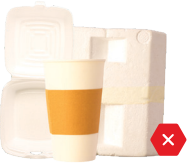
No Foam Cups & Containers