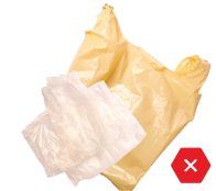
No Loose Plastic Bags, Recyclables in Plastic Bags, or Film Empty recyclables directly into your cart