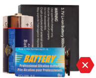
No Hazardous Waste or Batteries

© 2023 WM Intellectual Property Holdings, LLC. The Recycle Right recycling education program was developed based upon national best practices. Please consult your local municipality for their acceptable materials and additional details of local programs, which may differ slightly.