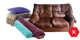
No Clothing, Furniture or Carpet