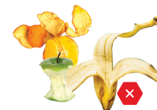
No Food or Liquids