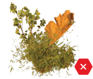
No Yard Waste